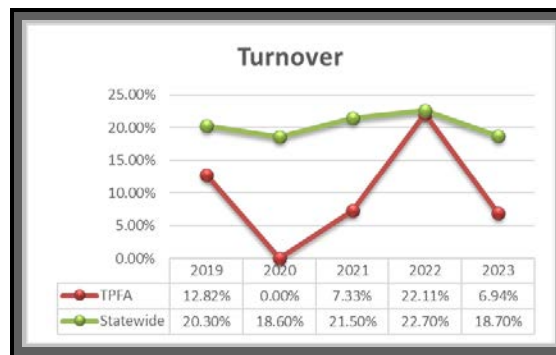
Note: Statewide turnover includes full-time classified employees as compared to TPFA turnover, which reflects permanent full-time, part-time, classified and exempt employees.

The graph below compares the Authority’s turnover trends to that of the State over a five-year period.